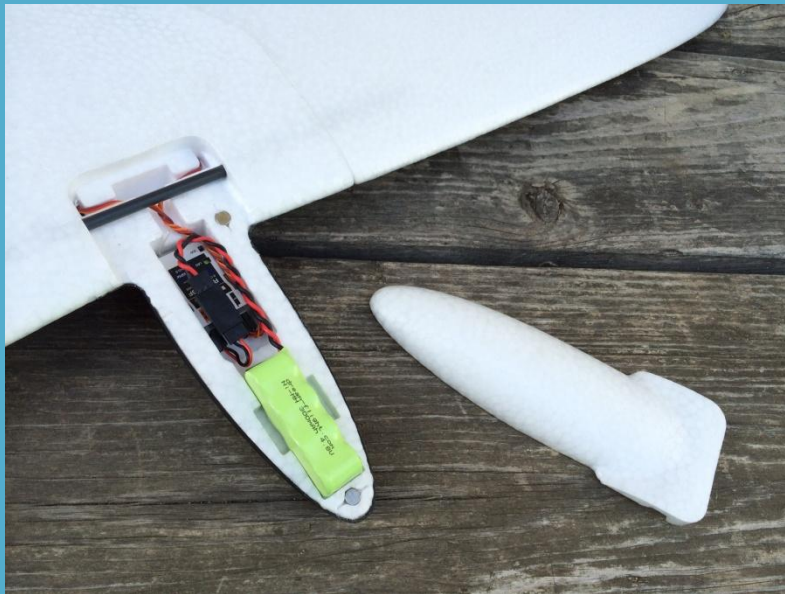
Roomy radio compartment with magnetic hatch provides easy access to your receiver and battery.