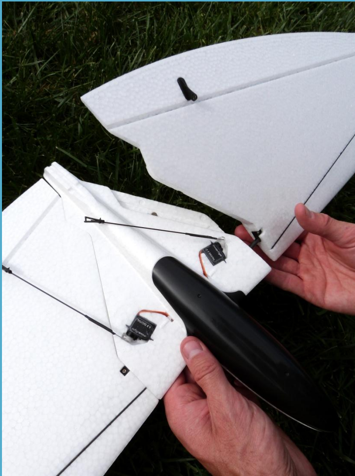
Modular Design - a clever interlocking design ensures perfect wing surface alignment and a secure fit to the fuselage.