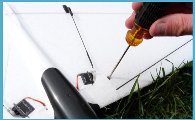
With a quick turn of the screwdriver, the Alula-TREK's wings can be secured or removed in seconds.