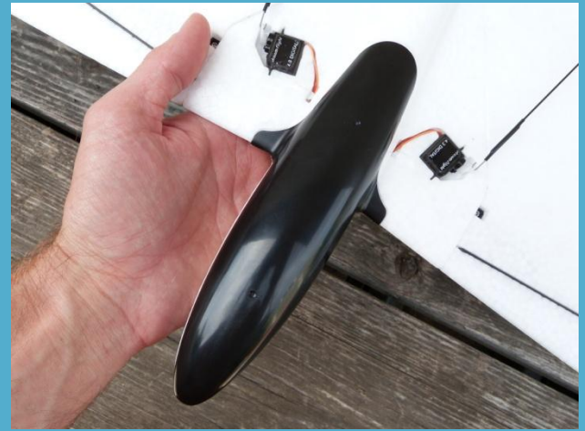
A rugged factory-installed belly skid is ready for those rougher touchdowns.